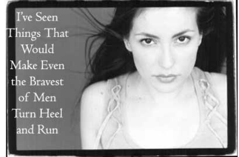
Kennedy talks about life on patrol as a slayer.

I have to admit I was amazed and had to ask how Kennedy managed to defeat it, which she obviously did since she was still sitting here.