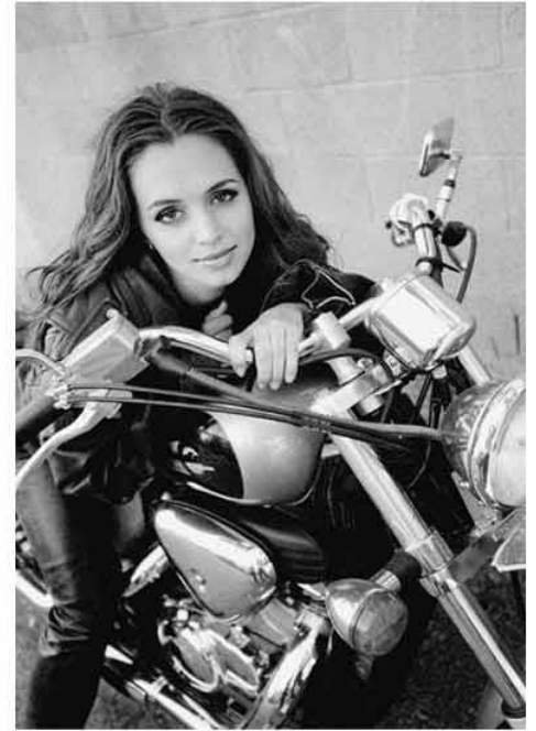
Head of the Slayer Division, Faith Lehane

If you go out after dark without a cross or a stake, you're asking for trouble. You can't protect yourself if you don't have